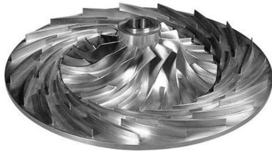
Figure 3: Sample for stator vanes after compressor